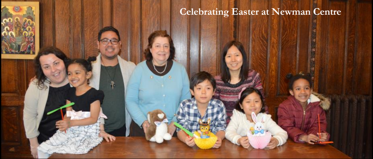
Celebrating Easter at Newman Centre