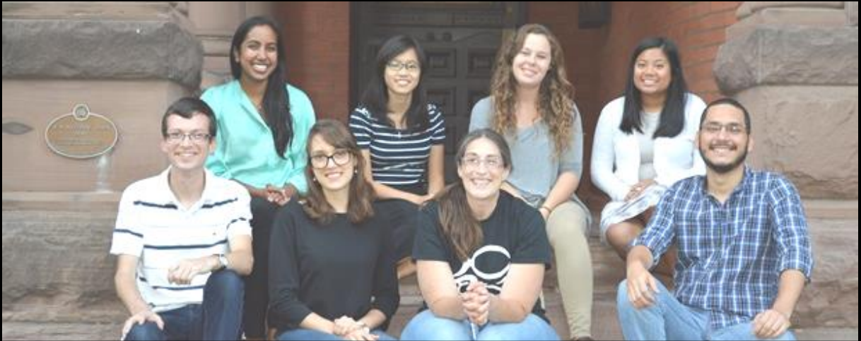
Newman Centre Student Campus Ministers 2016 - 2017